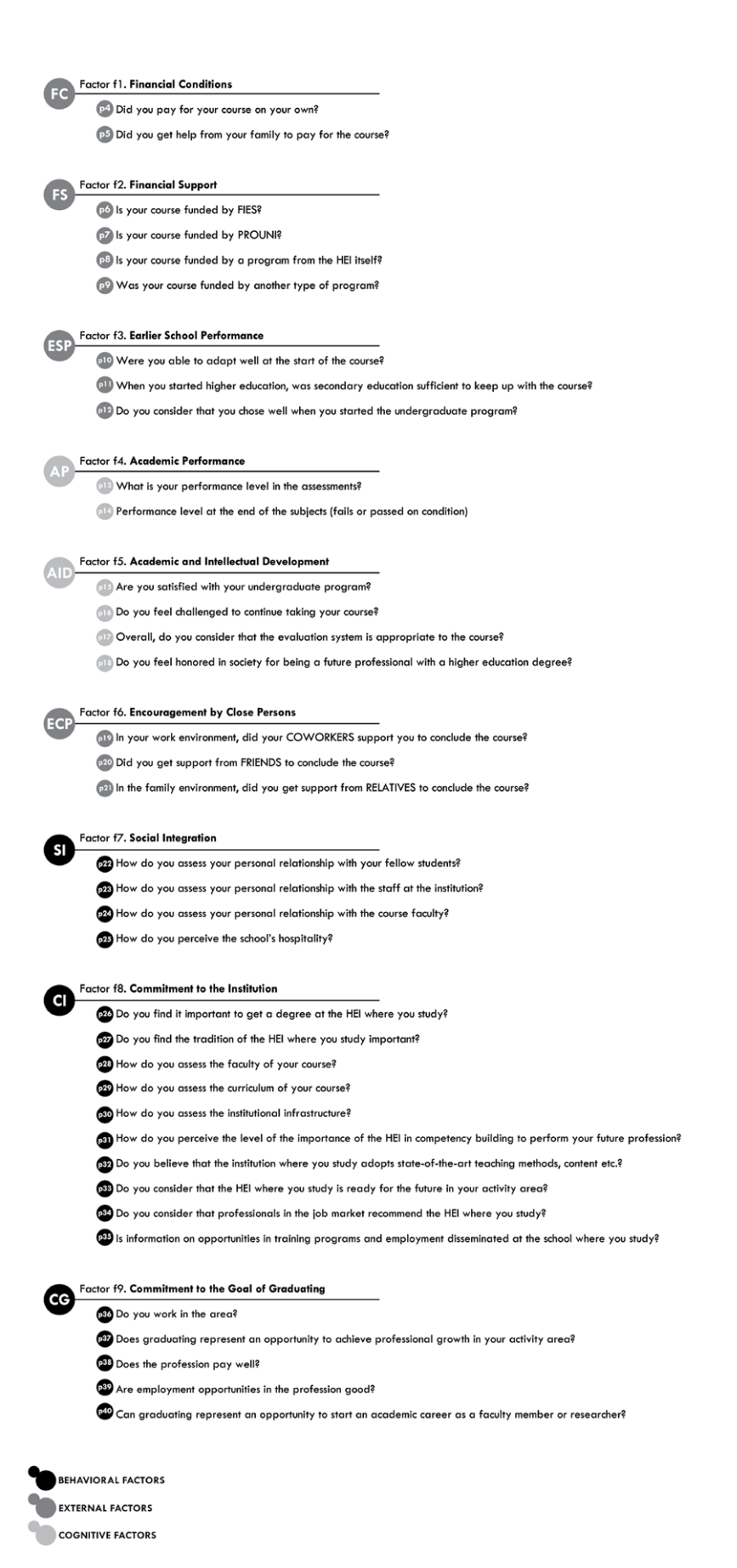
Figure 1. Questionnaire Applied