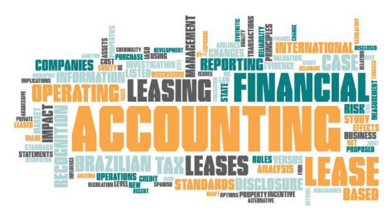
Figure 1. Word cloud of selected sample

After initial analyses of thematic adherence, 86 scientific articles were selected, 57 of which were international and 29 Brazilian. As a form of validation of the keywords of the research, a word cloud was developed based on all the selected titles, according to Figure 1. One of the objectives was to verify if other words could have been considered in the initial selection. In addition, the appearance of certain terms already evidences possible thematic categories.